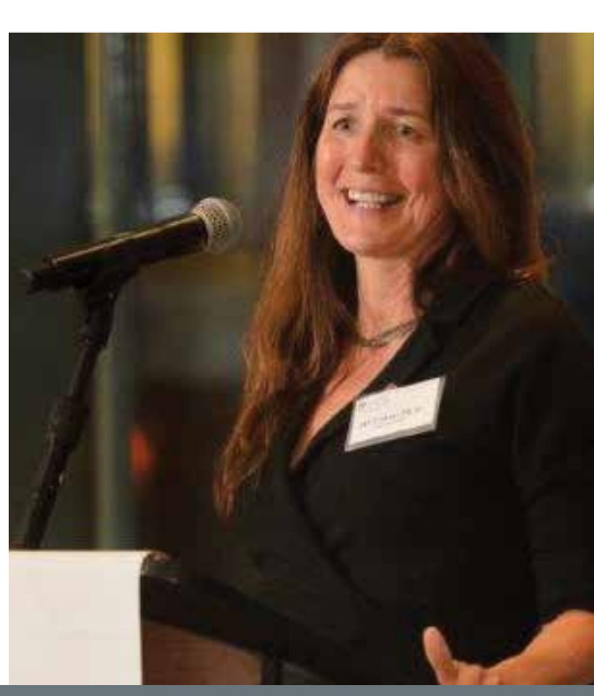
Klerman Freedman Awards Dinner, July 25, 2014